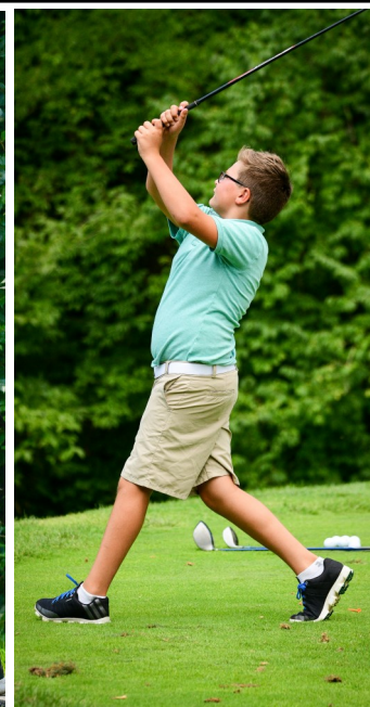
Annual Golf Outing! - more inside!